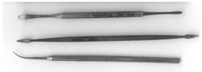
Metal tools for use with wax or clay

The instructor will bring a variety of specialized tools from her studio so that you may see and feel them, thus you don't need to commit to many specialized tools up front. As a place to start in your search, SculptureDepot.com has a nice selection of tools.