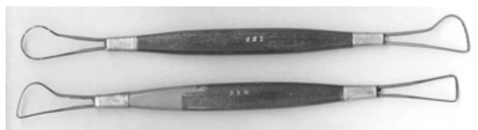
Loop tools for sculpting